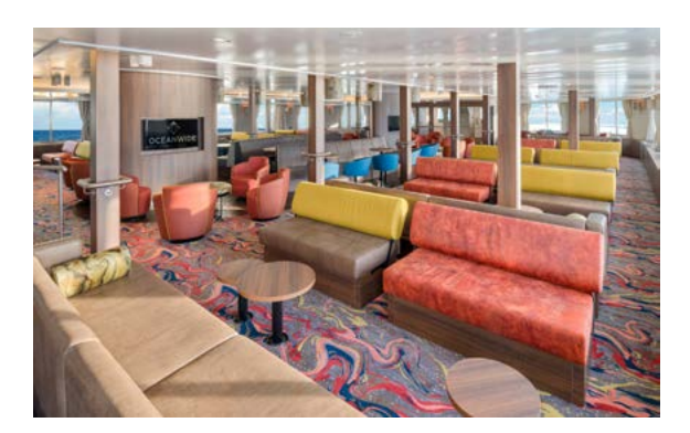
Bar & observation lounge